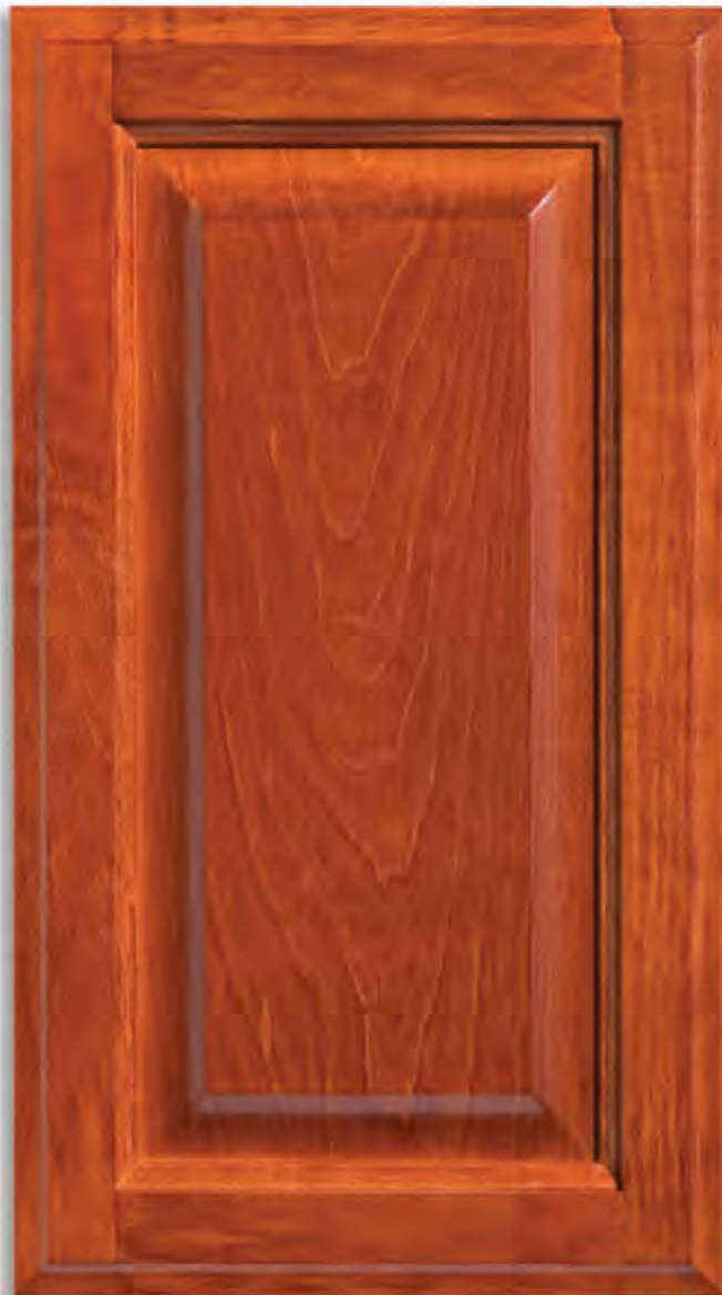
Shown: Cherry Maple (CM)

*Due to limitations of color reproduction in photography and printing, colors may vary. Please visit an authorized Jenson Vanities dealer to see genuine color samples.